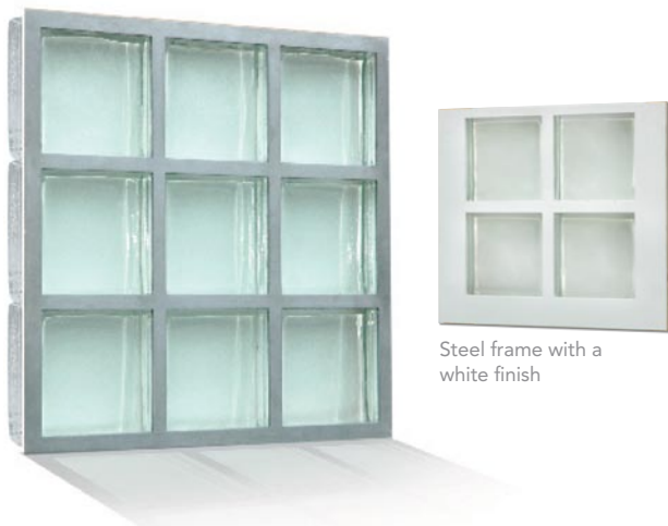
Steel frame with a white finish