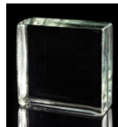
Laminated VISTABRIK®, Clear