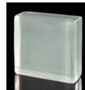
Laminated VISTABRIK®, Sandblasted

(Laminated VISTABRIK® Solid Glass Block meet UL 752 ballistic resistance levels 1 thru 6.)