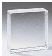
VISTABRIK® STIPPLED Solid Glass Block

(VISTABRIK® Solid Glass Block meet UL 752 ballistic resistance levels 1, 2 and 6.)